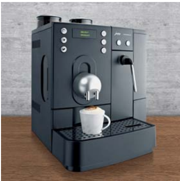
X7 shown in Black