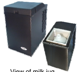
View of milk jug inside cooler