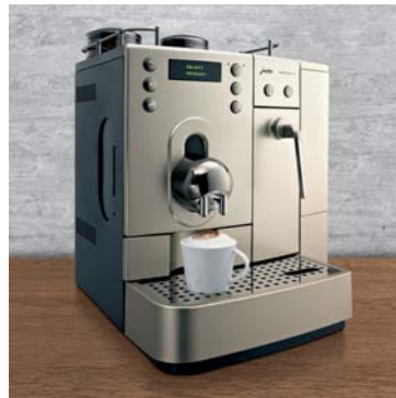
X7 shown in Silver